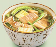
SINIGANG NA BABOY 335