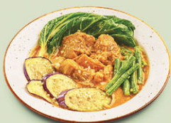
KUYA J KARE-KARE 450