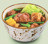
KUYA J BULALO 430