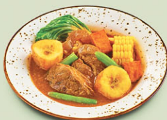
POCHERO BULALO TAGALOG 380