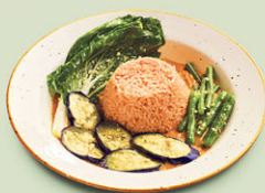
VEGETABLE KARE-KARE 199