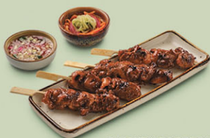
CHICKEN BARBECUE 310