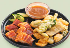
LECHON KAWALI 345