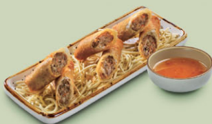
LUMPIA PRITO 245