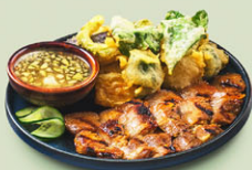
GRILLED PORK BELLY 335