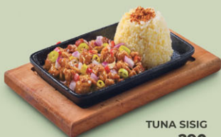
TUNA SISIG 290