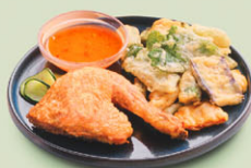
KUYA J FRIED CHICKEN 330