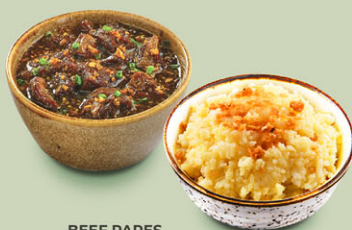
BEEF PARES 325