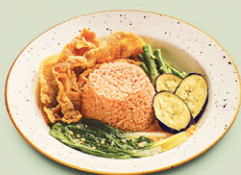
CRISPY BAGNET STRIPS KARE-KARE 249