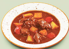
BEEF CALDERETA 430