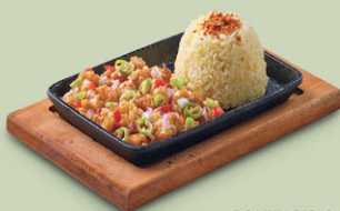
SQUID SISIG 299