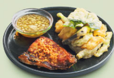
CRISPY BANGUS ALA POBRE 320