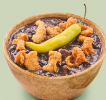
CRISPY DINUGUAN 299