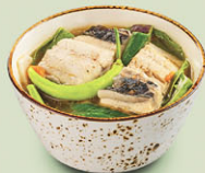
SINIGANG NA BANGUS 320