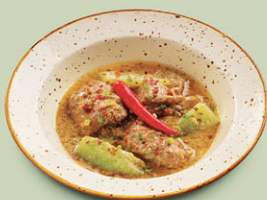
CHICKEN HALANG-HALANG 290